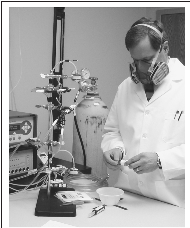
FIGURE 2. Photoacoustic infrared spectrometer, sampling apparatus, sampling pumps, and bone cement preparation with mixing container

test timeline used during this investigation are presented in Table II. The test timeline chosen for this experiment was 13 min in duration. Although the photoacoustic spectrometer should detect the presence of MMA during all time regimes, the Dräger and NIOSH methods have detection limits that could be impacted by shorter sampling intervals. Each cement preparation and monitoring event was conducted under identical environmental conditions in an industrial hygiene calibration laboratory. Temperature, humidity, and pressure levels were